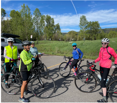
Meeting up at River Creek Park