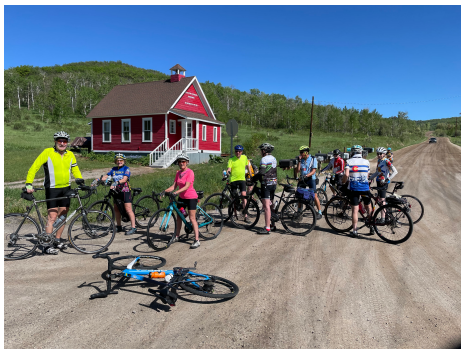
Red School House Ride