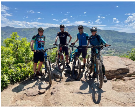
Mountain biking group on top of Emerald Mountain