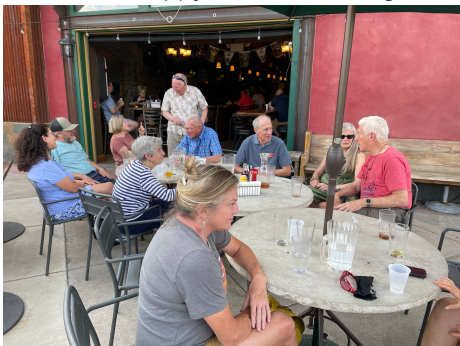
Informal Happy Hour at McKnights

https://www.ssothg.org/hiking for full details and a list of suggested items to carry with you. As in the past, we will be starting out slowly and the hikes will gradually increase in length and difficulty as the summer progresses. We are publishing one month of hikes at a time. Please double check the calendar https://www.ssothg.org/events and website for possible changes.