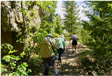
Mad Creek Hike