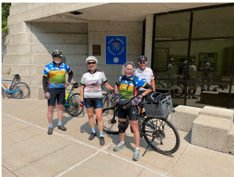
Glenwood Canyon Ride