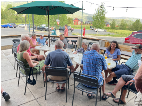
Informal Happy Hour at McKnights