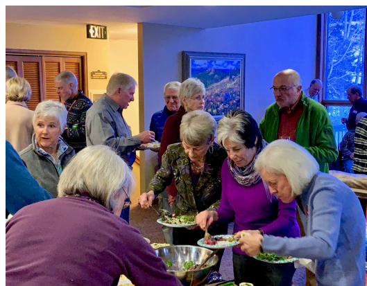
March Potluck at the Ranch

- After each social event, the votes will be tallied. Results will be published in the monthly newsletters and on the website. Donations will be distributed at the end of the year November/December based on the votes received during the year at social events (i.e., Happy Hours, Potlucks & Restaurants.) The top 2 or 3 organizations will be selected and our donation to them will be based on remaining funds in our budget AFTER all expenses have been accounted for.