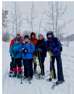
Snowshoers at Pleasant Valley