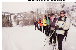
Snowshoers at Pleasant Valley