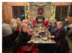
Ore House Dinner