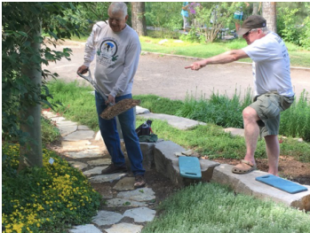
OTHG working at Botanic Park