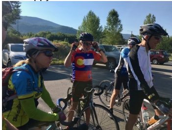
Road Biking Group