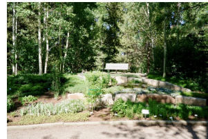
OTHG'S a Garden for All Seasons