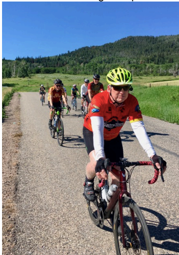
Gravel Biking Group