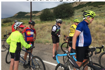
Biking group spots a rattlesnake

Directions: At the intersection of US 40 and Rt. 129 (Elk River Road), go WEST on US 40 and then NORTH on CR 42 to the MAIN ENTRANCE of Marabou. (You will pass the back gate first -- keep going). The address of the main entrance is 41255 Marabou Loop, if using GPS. Turn into the main entrance and continue on Marabou Loop to Riverkeeper Drive. Turn LEFT on Riverkeeper and go down past the barn to the main lodge. There will be EXTREMELY LIMITED parking so please carpool! Call Karen Whitney at 443-695-5215 if you get lost.