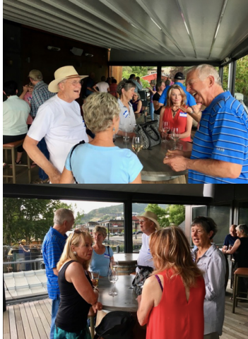
Happy Hour at Aurum's Deck